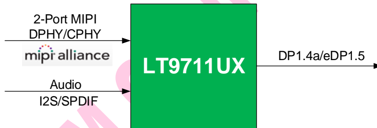
Figure 3.1 Application Diagram