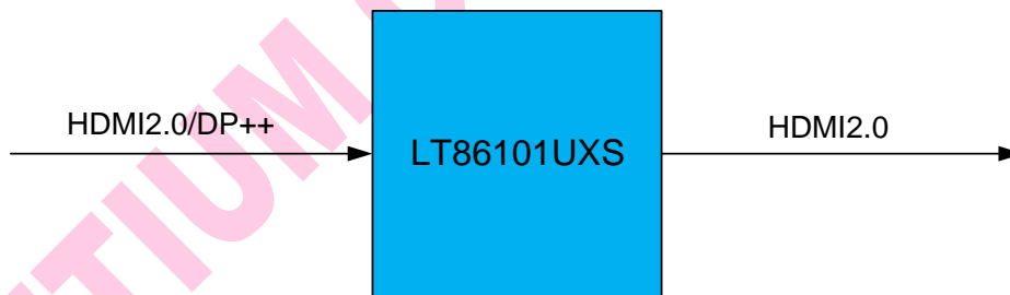
Figure 3.1 Application Diagram