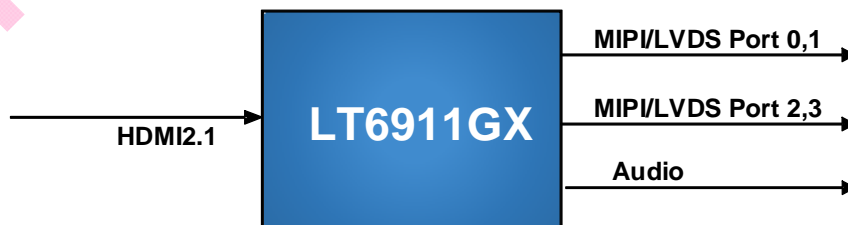
Figure 3.1 Application Diagram